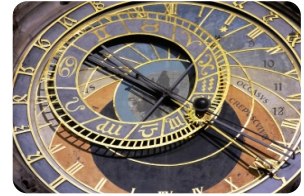
Prague Astronomical Clock