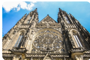
St. Vitus Cathedral

Note: There will be no sightseeing tour in the city of Nuremberg.