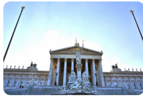
Austrian Parliament Building