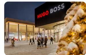
Meiqingen Famous Village