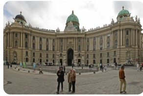
Hofburg Imperial Palace