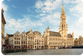
Grand Place, Brussels

During the tulip season from March 21 to May 15, 2024, we will go to Keukenhof instead of Zaanse Schans.