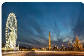
Place de la Concorde