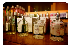
Paris Flower Palace Na perfume factory