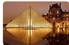
Musée du Louvre