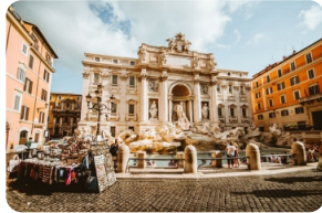
Fontana di Trevi