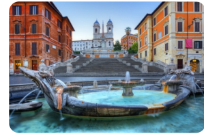
Plaza of Spain