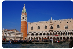
St. Mark's Square