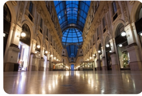
Emanuele II arcade bridge