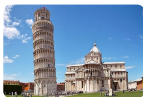
Leaning Tower of Pisa and its surroundings