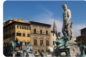
Piazza della Signoria