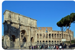
Arch of Constantine