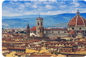
Cattedrale di Santa Maria del Fiore

After breakfast we will have full sight seeing in Florence. The cradle of the Renaissance and the world capital of art in the 15th century, it boasts one of the oldest historic centres and some of the most famous museums in the world, as well as one of the most iconic and distinctive landscapes as far as the eye can see. Visit [The Cathedral of Santa Maria del Fiore], [Piazza della Signoria] and [ Vasari Corridor] . Overnight near Rome.