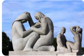
Vigeland Sculpture Park