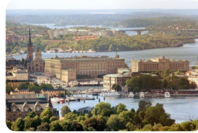
Stockholm Old Town