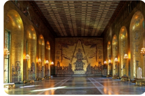
Stockholm City Hall

*The tour guide will adjust the order of Stockholm's tours on the 2nd and 4th days based on actual conditions!