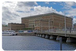
Stockholm Royal Palace

*The tour guide will adjust the order of Stockholm's tours on the 2nd and 4th days based on actual conditions!