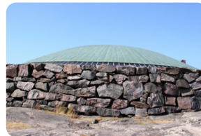
Underground rock church