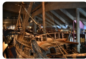
Vasa Shipwreck Museum