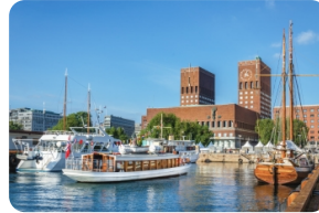
Oslo City Hall