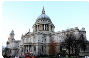
St. Paul's Cathedral