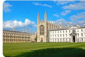
King's College, Cambridge

Christ Church is a constituent college of the University of Oxford in England. Founded in 1546 by King Henry VIII, the college is uniquely a joint foundation of the university and the cathedral of the Oxford diocese, Christ Church Cathedral. The buildings have inspired replicas throughout the world in addition to being featured in films such as Harry Potter and The Golden Compass. The college's alumni include 13 British prime ministers (the highest number of any Oxbridge college), as well as former prime ministers of Pakistan and Ceylon.