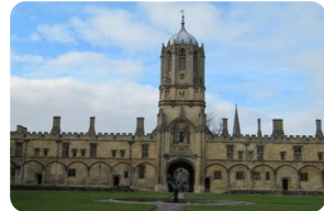
Christ Church, Oxford [Christ Church, Oxford]