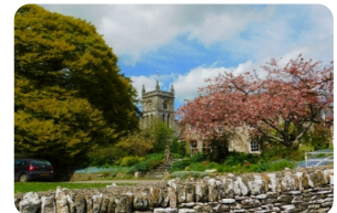
Private group_Burton on the water