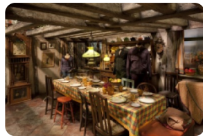
Harry Potter on set 2

December 25-26, 2025 are unavailable for booking.