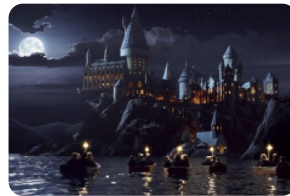
Harry Potter Studio