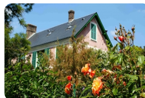
Monet Gardens and Former Residence