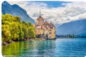
Château de Chillon