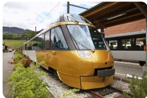
Golden Pass Line Golden Pass Line