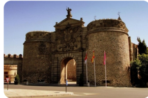
Toledo Puerta del Sol