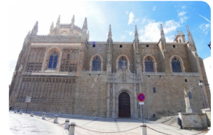
Royal Monastery of San Juan