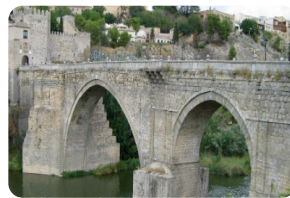
Saint martin bridge