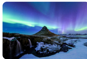
Snæfellsnes Peninsula Kirkjufell (Church Mountain) [Snæfellsnes Peninsula]

Snæfellsnes is the long and narrow peninsula sticking out of Iceland into the North-Atlantic ocean to the west. The peninsula offers dramatic landscapes and examples of most of the natural wonders found in Iceland and is therefore often called “miniature Iceland” or “Iceland in a nutshell.”