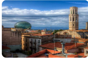
Dali Theatre Museum

Note: The tour is a daily one-day tour, and different tour guides may be arranged daily, subject to final confirmation.