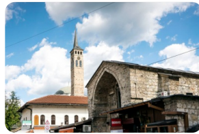
Sarajevo Clock Tower