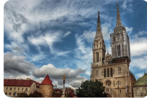
Assumption Cathedral (Zagreb Cathedral)

(2) Bosnia and Herzegovina is not part of the EU, so border controls may be in place. If border controls are encountered, the itinerary may need to be adjusted.