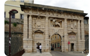
Zadar city gate