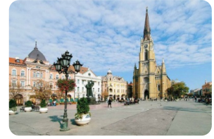
Novi Sad Freedom Square