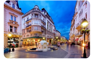
Mikhailo Dagong Street