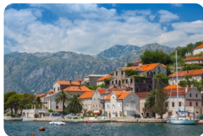
Old town of Kotor