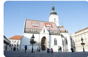
St. Marks Cathedral