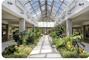
Tito Marshal Tomb