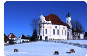
Pilgrimage Church of Vis