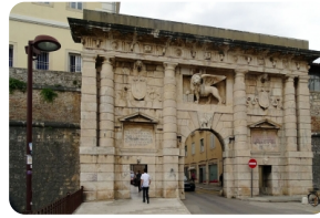
Zadar city gate