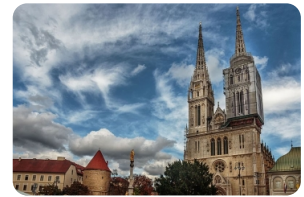
Assumption Cathedral (Zagreb Cathedral)