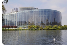
European Parliament Center