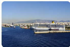
PLATYTERA TON OURANON luxury cruise liner