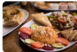
Cosmos luxury cruise