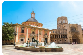
Plaza de la Virgen