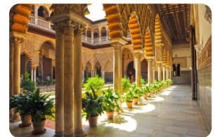
Royal Palace of Seville