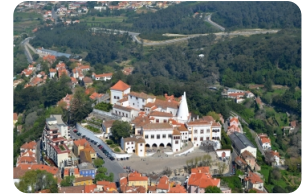
Sintra old district