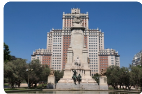
Plaza of Spain