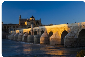
Ancient Roman Bridge in Cordoba