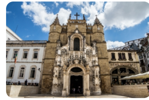
Coimbra Old Church