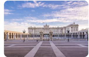
Royal Palace of Madrid