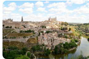
Ancient city of Toledo