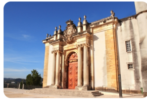
Baroque Library - University of Coimbra