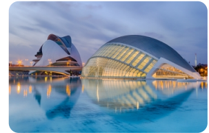
City of Arts and Sciences