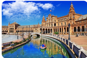
Plaza of Spain

Link: https://www.alcazarsevilla.org/en/schedules-rates/