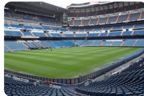
Real Madrid Stadium