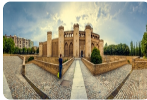
Al Hafiriya Palace