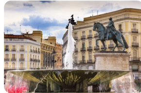
Puerta del Sol