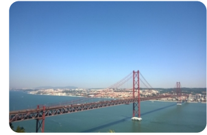
April 25th Bridge