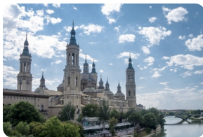
Cathedral of Our Lady of Bilal