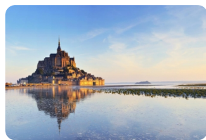
Mont Saint Michel