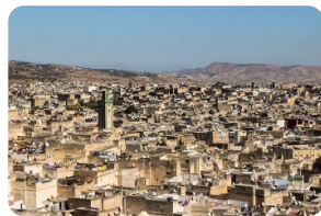
Médina de fes

(3) Due to limited hotel availability in Chefchaouen, accommodations may be adjusted to Tetouan instead.