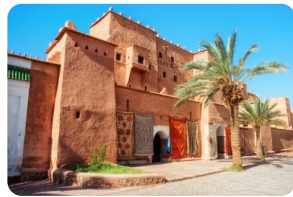
Moroccan Film Base

Kind Reminder: This day's winding mountain road takes more than 4 hours. If you are prone to motion sickness, please prepare motion sickness medication in advance.