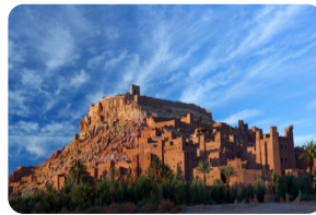
Ay Ben Haddou