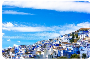
chefchaouen Ras Elma

If you book the 6-day, 5-night tour + an additional night in Casablanca on Day 6, you will be transferred to the hotel for your extra stay on the evening of Day 6, marking the end of the tour. There will be no itinerary on Day 7.