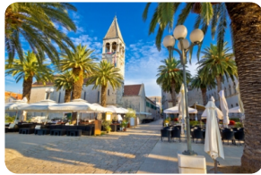
Trogir Old Town