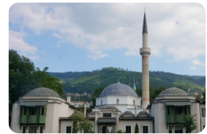
Sarajevo Grand Mosque