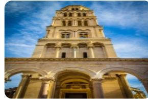
Cathedral of Saint Domnius