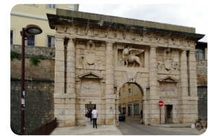
Zadar city gate