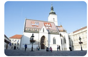
St. Marks Cathedral