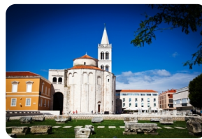
St. Donat Church