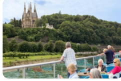
Rhine Valley Cruise