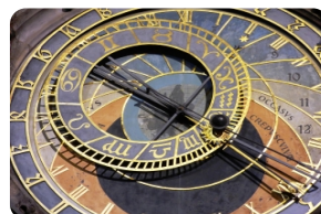
Prague Astronomical Clock