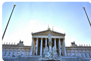
Austrian Parliament Building