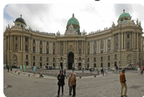
Hofburg Imperial Palace