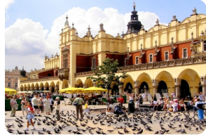
Central Market Square [Central Market Square]

The largest medieval square in Europe is also the most exciting place in Krakow.