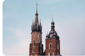
St. Mary's Church

The Neo-Gothic building, built at the end of the 19th century, is not only sleek, but also has an intrinsic structure. The multi-pleated arched doors and the geometrically aggregated ceilings are full of fun and beauty. Jagiellonian University is one of the oldest universities in Poland. The famous alumni are the astronomers Copernicus, Pope Paul II and the famous Polish poet Sinboska. The Nobel trophy of Sinboska is still in the school library.