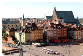
Warsaw Old Town