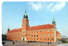
Royal palace castle